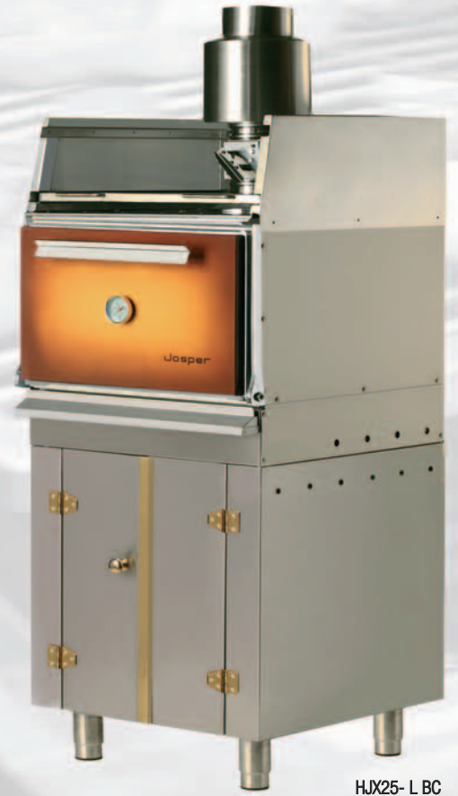
HJX25- L BC